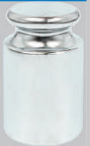
2 kg (WBA-3200) calibration weight included