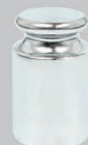
200g calibration weight included WBA-220